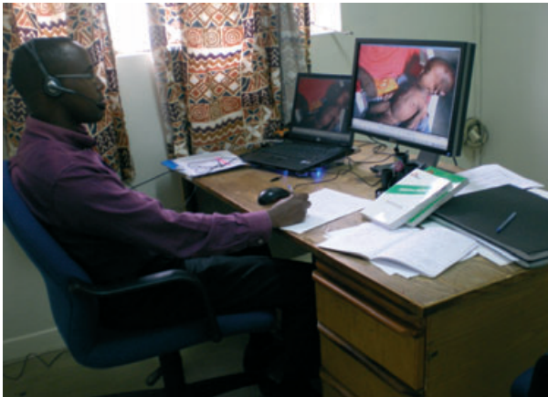
Figure 1 Consultation room and specialist paediatrician in Nairobi, Kenya conducting a telemedicine consultation with colleagues in Guri'el hospital, Somalia.

who spoke the Somali local language to counsel parents of very ill children, thereby fostering a positive relationship between the clinical team and parents. Paediatric management was in line with WHO and MSF clinical guidelines (MSF 2010).