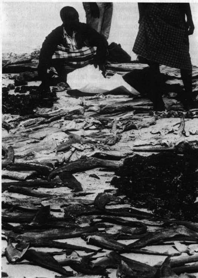
Figure 5 - Boosaaso/NE-Somalia (Fishing Cooperative): Large quantities of fish are salted and dried. Shark fins (foreground) gain the highest prices.