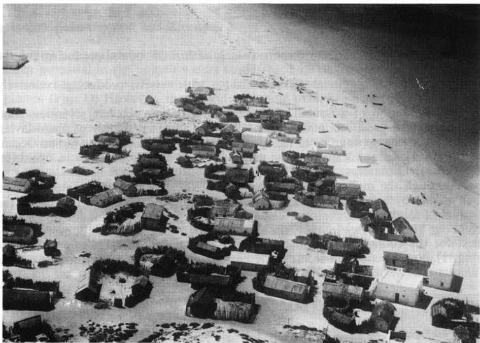
Figure 3 - Xaabo : Typical fishery settlement of NE-Somalia. The fishermen use traditional wooden craft and simple fishing gear (background).