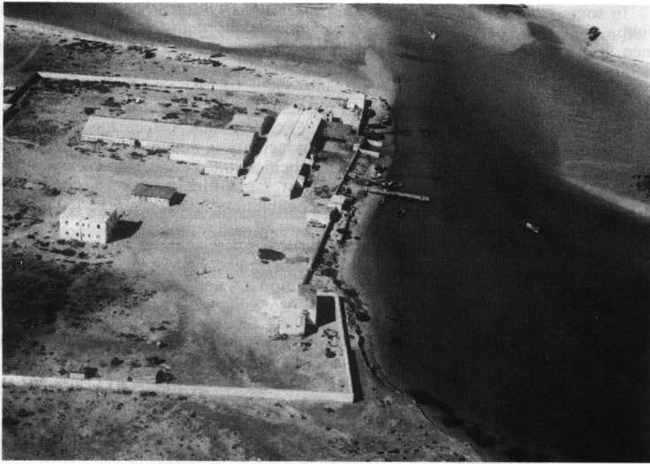
Figure 6 - Xaabo-Fish Factory : The canned fish production is mainly exported to Italy. The old equipment only allows a partial utilization of the potential capacity.

Since the early seventies most of the fishermen are at least nominally organized in cooperatives which have theoretically the purpose to provide them with basic facilities like loans, fishing gear, boats, spare parts, fuel, food stuff, marketing possibilities, training programmes etc. But the assistance really available to the fishermen so far is still very limited in most parts of coastal Somalia. Especially in the remote areas there are only very few government facilities available, and so only a small part of the huge fish potential of the Somali shelf zone is exploited. Another big problem is the poor accessibility of most of the coastal areas of Somalia which makes the marketing of fresh fish very difficult. Consequently most of the fish, especially sharks, are salted and dried (Figg. 4 and 5). Another significant hindrance to increasing fish production is the low sale price, which the fishermen get in the cooperatives and the fish factories. The prices for 1 kg of fresh fish in Xaabo and Qandala fish factories varied between 2-7 Somali Shilling (So.Sh.) in January 1986. Private sales prices in the markets however, being 20-30 So.Sh. per kg at that time, were much more attractive for the fishermen.