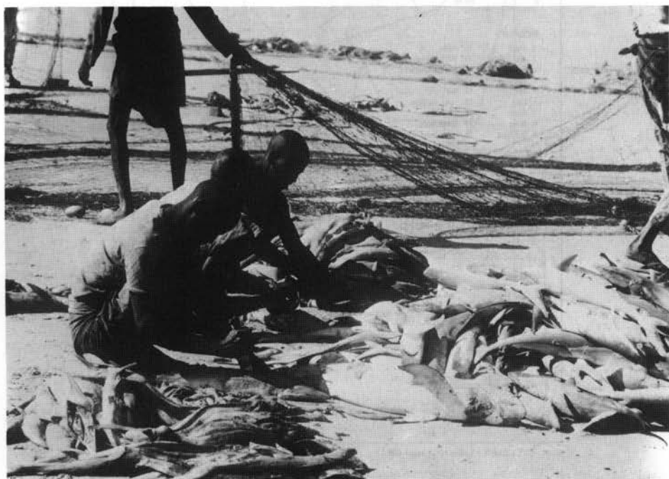
Figure 4 - Qandala /NE-Somalia: Sharks constitute a major part of the catches.