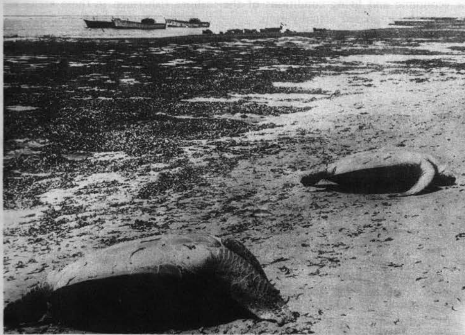
Figure 7 - A Beach near Ceel Axmed/S-Somalia: Dying sea-turtles. Preventive measures have to be set up for the protection of this menaced species.

6) Parallel to these measures intensive scientific research has to be undertaken in order to obtain a solid data basis for future planning and to protect the Somali fishing resources from possible damage through over-exploitation.